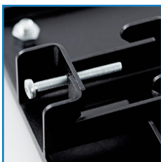
Securing the screen against falling with screws