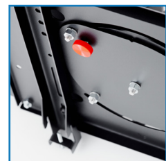
Wide range of VESA mounting standards