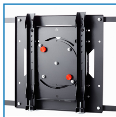
Minimalistic design and functionality