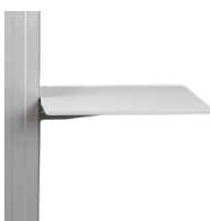
Side shelf for laptop