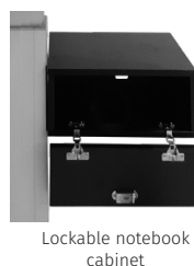
Lockable notebook cabinet