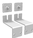
2 galvanized wall mounting brackets