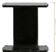
Extender for height adjustable aluminum columns in different versions