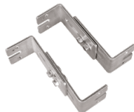
2 galvanized adjustable wall mounting brackets