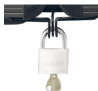
Brackets and wing lock for locking the side wings in front of the display