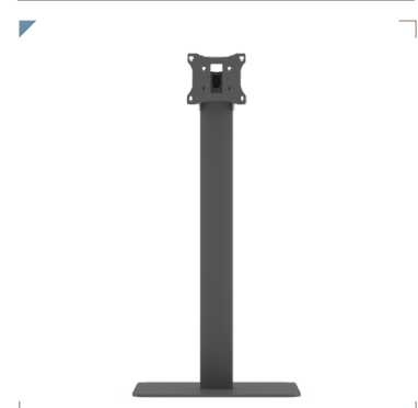
Icon Wayfinder 200