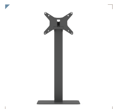
Icon Wayfinder 400