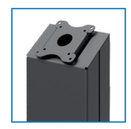
Dedicated space inside for cable organization