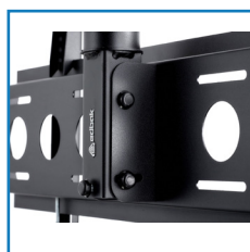
Tilt adjustment and rotation